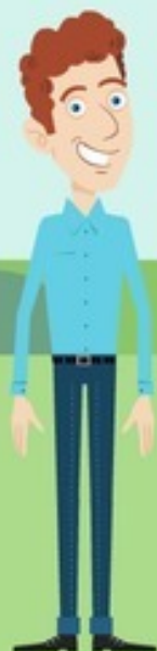
The Surrey Memorial ICP Team