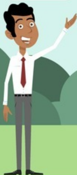
Fraser Health Medical Microbiologists